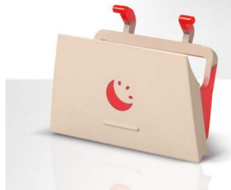
Backlit buttons with day & night design marking